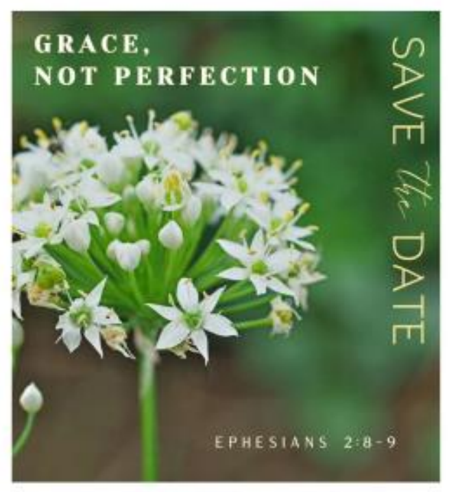
ST. TIMOTHY'S ANNUAL WOMEN'S WINTER RETREAT

of 20 buckets/lids from Lowes, we donated 45 Health Kits, 30 Cleanup/Flood Buckets, 7 Prayers Shawls, 96 School Kits. These items were loaded into Al Kerchner's SUV and along with Deb Stein delivered to the warehouse in Middle River, MD. They were very glad to receive. We also collected monies to purchase additional Lowes Gift Cards totaling $875 – these were delivered to the AMR Convocation held in Bloomsburg, PA on October 19<sup>th</sup>.